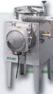
Machine of 20 litres