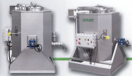
Machine of 500 litres

This process allows the distillation of all usual solvents.