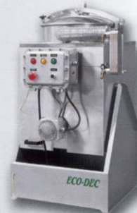
Machine of 150 litres